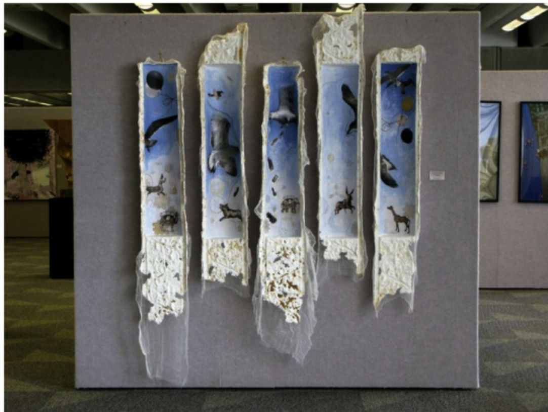
DBA 2012 Art Exhibition