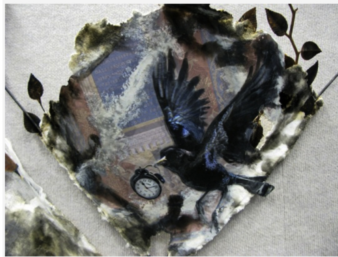
Debra Kaszovitz (detail)

Debra Kaszovitz's displays a series of wall sculptures made from cast paper, steel, encaustic, and photographs. Each piece is a sensuous palimpsest of images that have been backed up by steel and layered with multiple textures of gauze, paper, wax, found manuscripts, bold black birds, iconic images of time, human detritus, keys and even a smart phone.